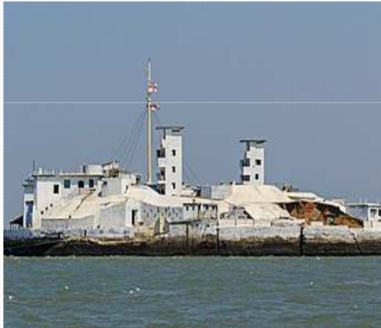
MIDDLE GROUND ISLAND BATTERY